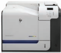
HP LaserJet Enterprise 500 color M551dn