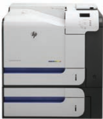
HP LaserJet Enterprise 500 color M551xh